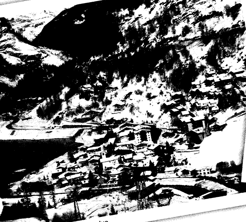
Tignes Les Brevières: Dam good value