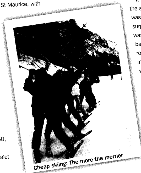
Cheap skiing: The more the merrier

Result: eight very proud and happy parents. □